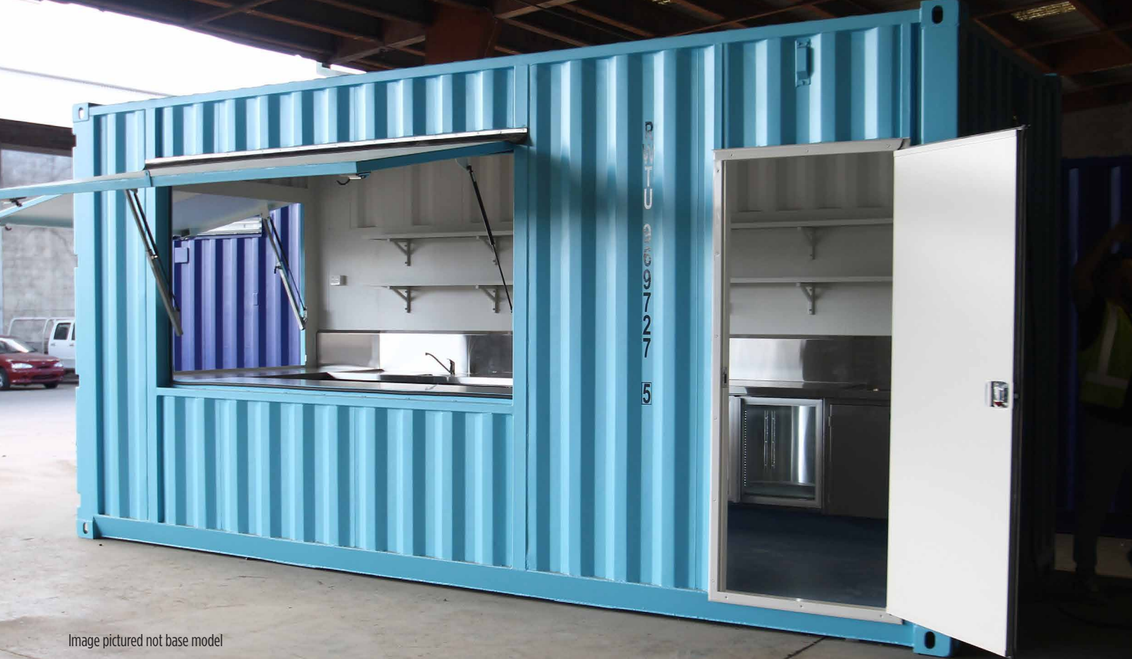
Image pictured not base model